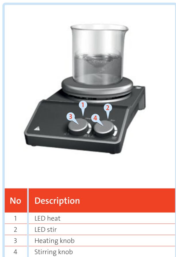
Figure 2. Device's control elements